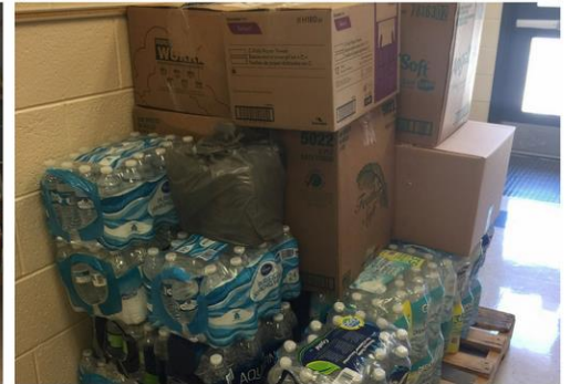
Family Fun Night