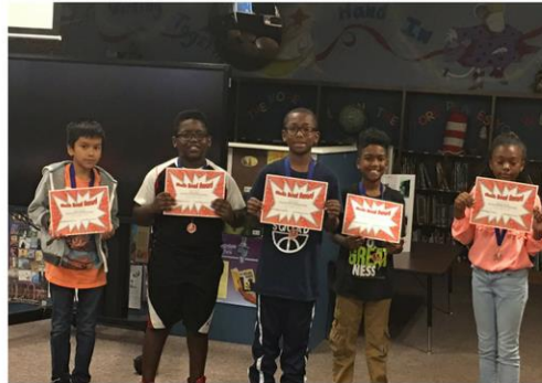
3 rd Grade Field Trip